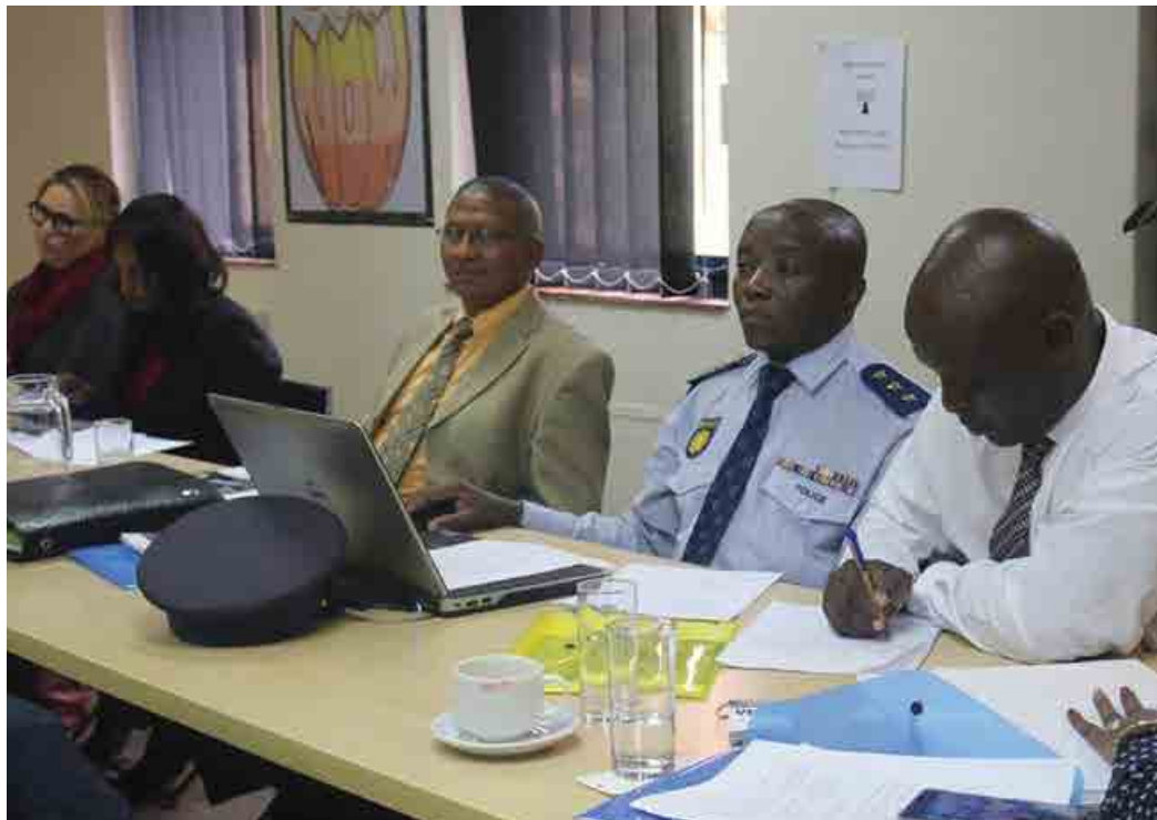
Participants at the Dialogue

Informal trading permits are conceived of as a form of social assistance rather than legitimate trading, so authorities often target the indigent, or restrict the number of permits to one person in a household. This is seen as a kind of handout, and it plays into the idea that informal traders are