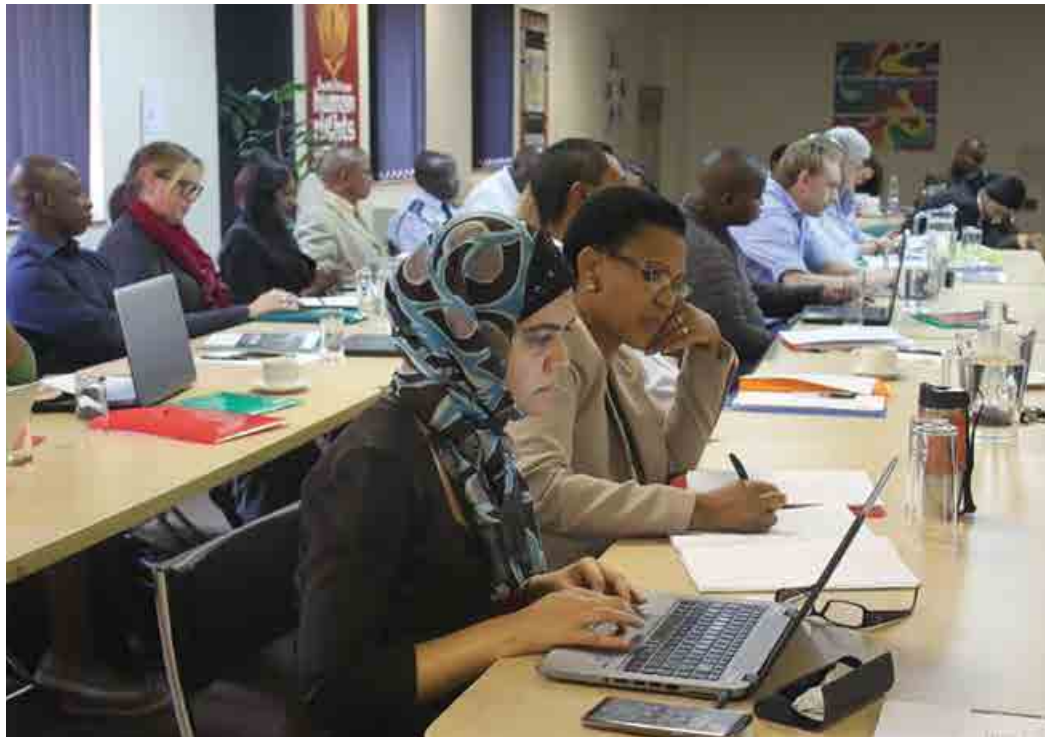
Participants at the Dialogue

Police are, however, vulnerable themselves. Trauma in the police is severe and suicide figures are very high. There are too few police psychologists. Whenever a police officer has been involved in a fatal shooting, that member should not be allowed to carry a firearm until such time as a psychiatrist gives permission. There should be debriefing after any POP operation because police members are often aggressive at that point. During the Lwandle Commission of Inquiry into the evictions of hundreds of people, it emerged that police who were engaged in the evictions were not debriefed after the first day of events, and the lack of debriefing could have contributed to police violence against those people on the second day.